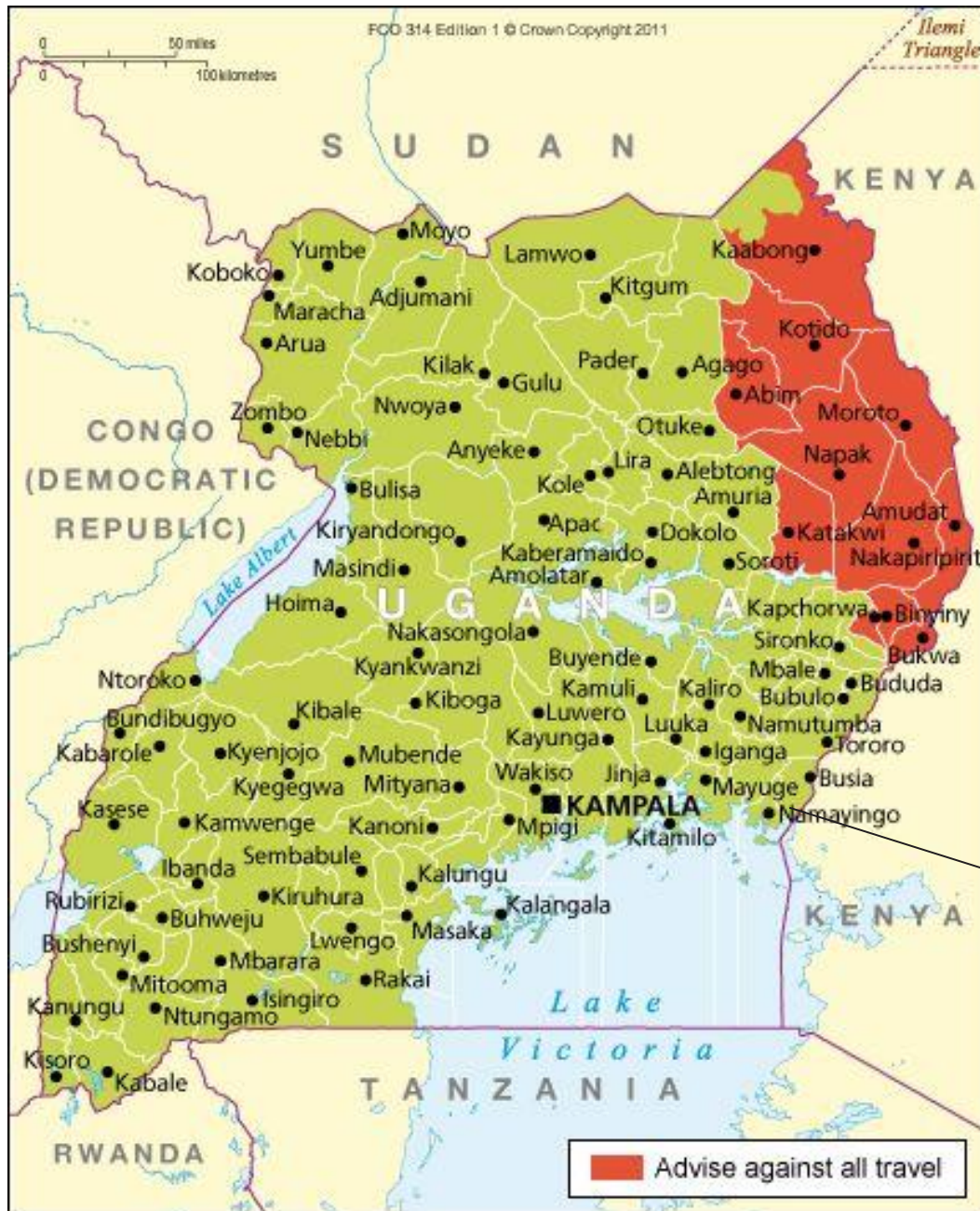
Map illustrating EAA catchment area